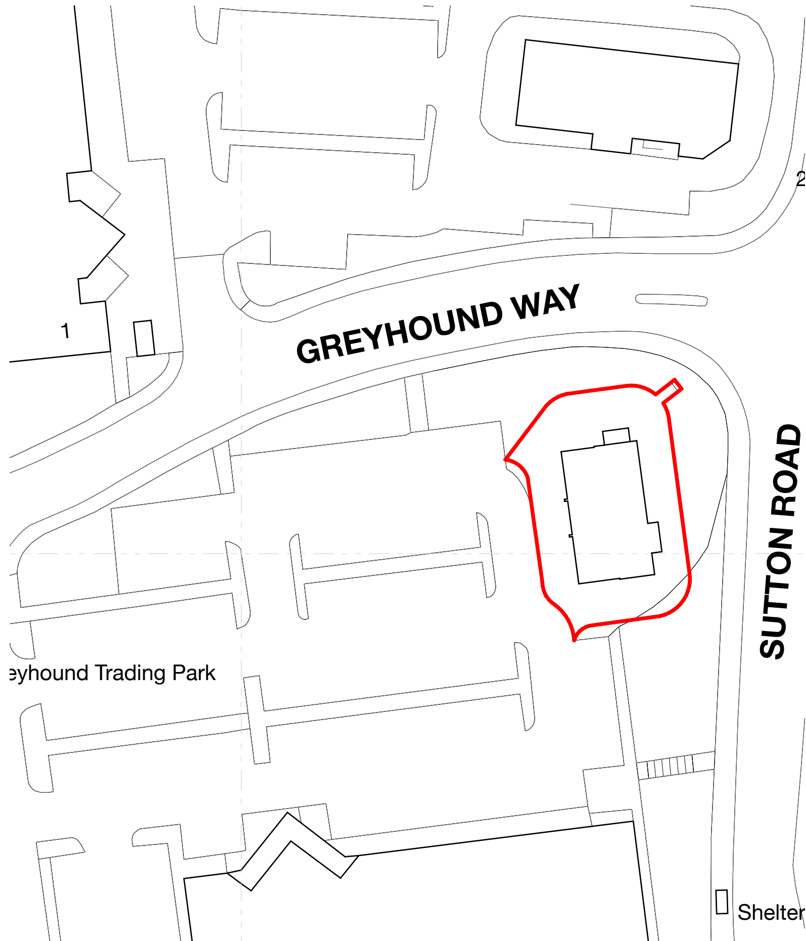
BLOCK PLAN, 1:500